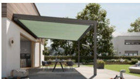
Glass canopy awnings