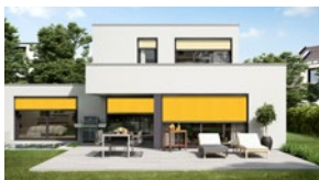
Vertical roller blinds