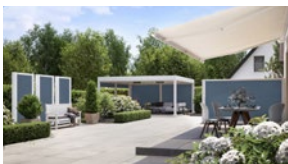
Wind and privacy protection